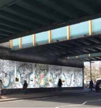
Artist's impression (west side)