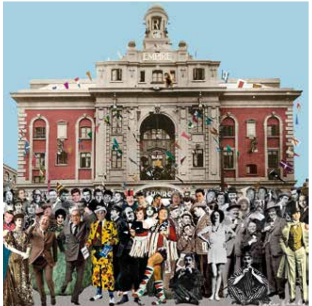
Chiswick Empire Theatre by Sir Peter Blake

the masterminds of Abundance London, the voluntary group that organises environmental and educational projects such as guerrilla gardening, planting flowerbeds on the High Road and running Apple Days. The mural has been their most ambitious venture to date.